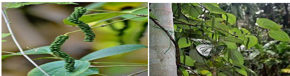
Fig. 1 Unripe drupes of Black Pepper ( Piper Nigrum )

The author of this research work is exploring the trade routes connecting Korkai port of Tamil Nadu and Muzhiri Port (Kerala) . The trade routes originating from the Thandikudi mountain village to korkai and interlinking pattern with the Muzhiri Pattanam port town and other port towns are under study. Like the Silk Road the spice route of ancient Tamil Nadu comprising today's Kerala, is gaining momentum for focused research.