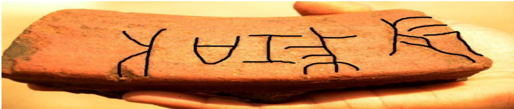
Fig. 3 The Tamil Brahmi script which mentions “a ma na”.

A Tamil-Brahmi script on a pot rim, reading “a ma na”, meaning a Jaina, has been found at Pattanam in Ernakulam district, Kerala, the script can be dated to circa second century CE[3]. The Kerala Council for Historical Research (KCHR) has been conducting excavations at Pattanam since 2007, with the approval of the Archaeological Survey of India. The pot-rim was found during the sixth season of the excavation currently under way. Pattanam is now identified as the thriving port called Muziris by the Romans. Tamil Sangam literature celebrates it as Muciri [3].